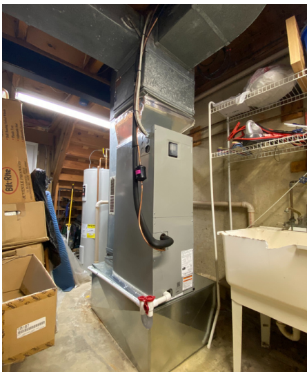
Tran Energy Services completed a full energy audit on the home and installed a new HVAC system.