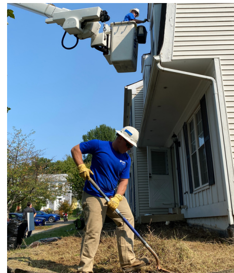
Dominion Energy even brought a bucket truck to help with some exterior painting.