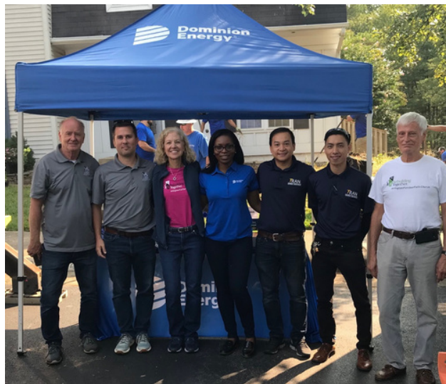
Collaboration coming together! Members from CHP Energy Solutions, Dominion Energy, Rebuilding Together AFF, and Tran Energy Services.