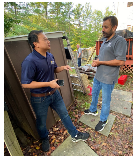
Tran Energy Services and CHP Energy Solutions working together.