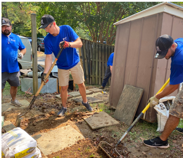
More Dominion Energy employee volunteers grade, lay pathway pavers and level a shed.