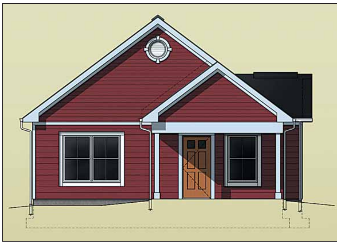
A colored front elevation drawing for the 2 bedroom Pulaski homes. The three bedroom homes will look similar.

If an individual fails to meet income requirements or is found not to have "mortgage ready" credit, they can receive free financial and home buying counseling. Lawson explained that, for example, if an individual is found not to have mortgage ready credit, they will receive counseling in how to